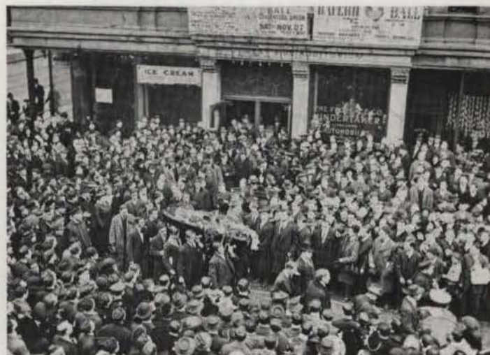
The funeral of Joe Hill, the martyred I.W.W. organizer and songwriter, in Chicago in 1915.

The existing guide to the I.W.W. Collection is currently being revised and updated to facilitate better use of the material. The new guide will include numerous pamphlets and related material added to the I.W.W. Collection since 1965.