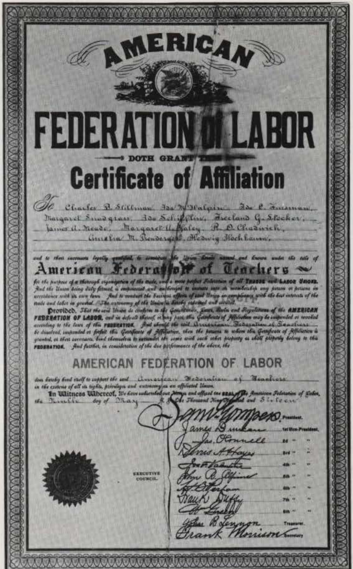
Certificate of Affiliation of the American Federation of Teachers with the American Federation of Labor, May 9, 1916.

Included with the NCAD records are the files of the United Farm Workers Organizing Committee Boycott